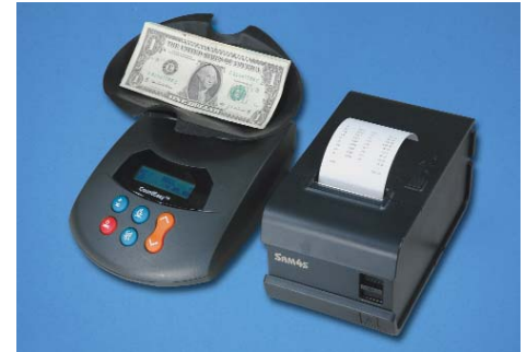
Add the Ellix 10 Thermal Printer to Run Grand Total and Subtotal By Denomination Reports