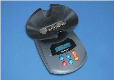
Standard FlexiCup™ for Simple Coin Handling