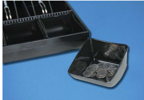
Optional Till Cups Fit Popular Cash Drawers